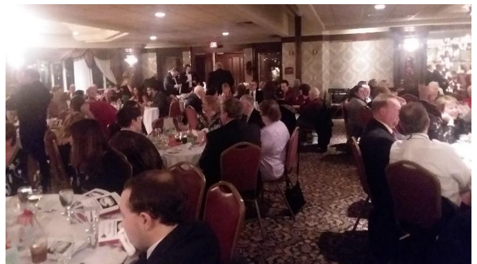
(above & below) Some of the 200+ patrons attending the 90 th State Charity Ball, the State's premier charitable fundraiser.