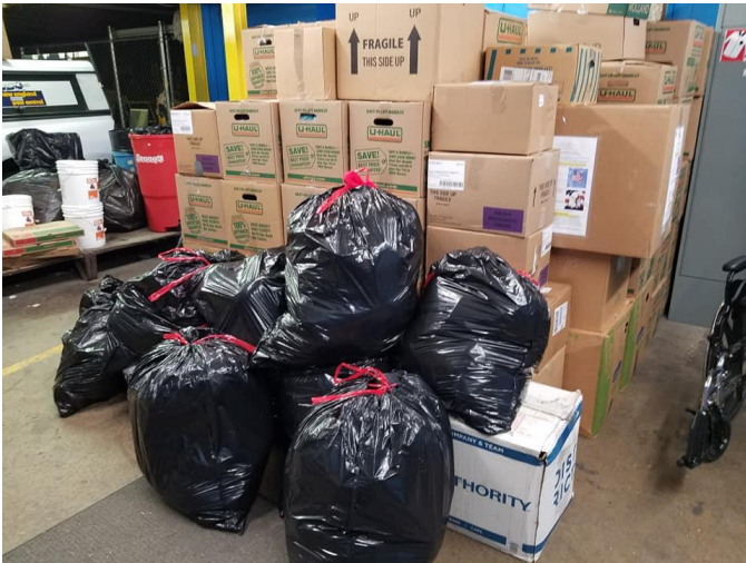
The Knights contribution to ROVAC, ready to be delivered.