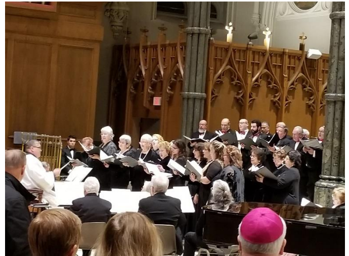
The Cathedral Choir.