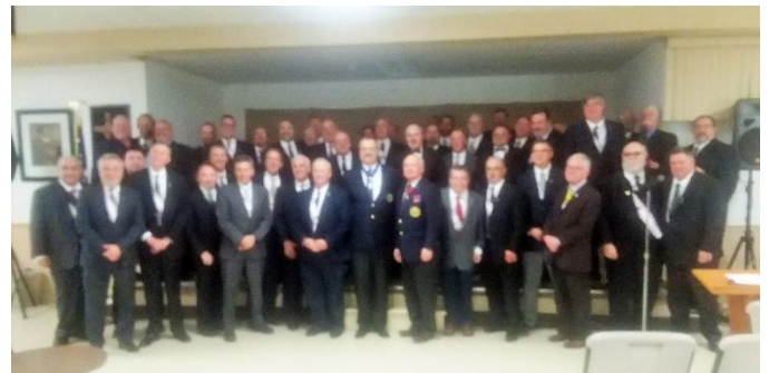
The Patriotic Degree Class of 2018